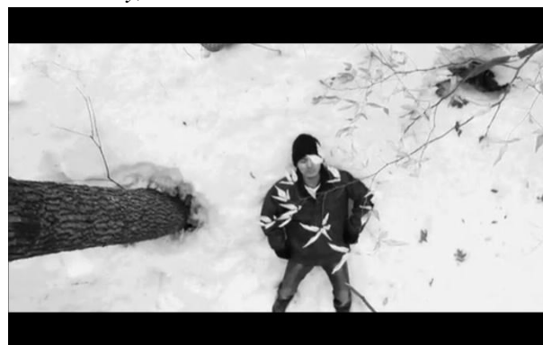
Youth Coalition member at the Summit Opening Video Shoot

Abstract: A hearty THANK YOU to the good folks Aria Show Technologies and KCPC Youth Coalition members for sowing their time, voices and energy into this year’s Youth Summit Opening video! The Opening Summit video is one of the coalition’s premier ‘surprise’ Summit features used to generate excitement about the current ATI-Kent County theme and to kick-off the entire conference experience.